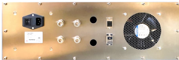
Picture of the rear panel