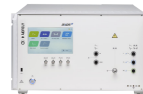
AXOS 8 Compact Test System

Surge 1.2/50µs...8/20µs IEC/EN 61000-4-5 Telecom Wave 10/700µs (1) IEC/EN 61000-4-5 & ITU Ring Wave IEEE C62.41 IEC EN 61000-4-12 EFT/Burst IEC/EN 61000-4-4 Voltage Dips IEC/EN 61000-4-11 (2) IEC/EN 61000-4-29 (4) Magnetic Field IEC/EN 61000-4-9 (3)