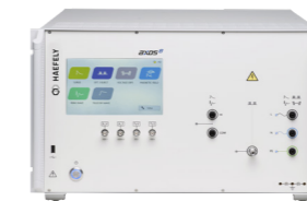
AXOS 8 Surge Test System

Surge 1.2/50µs...8/20µs IEC/EN 61000-4-5 Telecom Wave 10/700µs (1) IEC/EN 61000-4-5 & ITU Ring Wave IEEE C62.41 EFT/Burst IEC/EN 61000-4-4 Voltage Dips IEC/EN 61000-4-11 (2) IEC/EN 61000-4-29 (4) Magnetic Field IEC/EN 61000-4-9 (3)