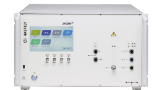
AXOS 8 Ring Wave Test System

Surge 1.2/50µs...8/20µs IEC/EN 61000-4-5 Telecom Wave 10/700µs (1) IEC/EN 61000-4-5 & ITU Ring Wave IEEE C62.41 EFT/Burst IEC/EN 61000-4-4 Voltage Dips IEC/EN 61000-4-11 (2) IEC/EN 61000-4-29 (4) Magnetic Field IEC/EN 61000-4-9 (3)