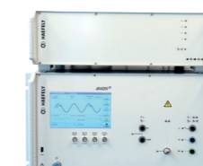
AXOS 8 Dips Test System

Surge 1.2/50µs...8/20µs IEC/EN 61000-4-5 Telecom Wave 10/700µs (1) IEC/EN 61000-4-5 & ITU Ring Wave IEEE C62.41 EFT/Burst IEC/EN 61000-4-4 Voltage Dips IEC/EN 61000-4-11 (2) IEC/EN 61000-4-29 (4) Magnetic Field IEC/EN 61000-4-9 (3)