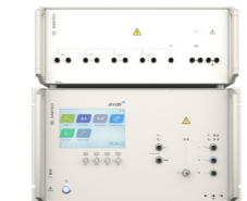
AXOS 8 Telecom Wave System

Surge 1.2/50µs...8/20µs IEC/EN 61000-4-5 Telecom Wave 10/700µs (1) IEC/EN 61000-4-5 & ITU Ring Wave IEEE C62.41 EFT/Burst IEC/EN 61000-4-4 Voltage Dips IEC/EN 61000-4-11 (2) IEC/EN 61000-4-29 (4) Magnetic Field IEC/EN 61000-4-9 (3)