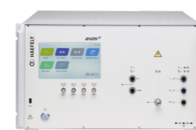
AXOS 8 EFT/Burst Test System

Surge 1.2/50µs...8/20µs IEC/EN 61000-4-5 Telecom Wave 10/700µs (1) IEC/EN 61000-4-5 & ITU Ring Wave IEEE C62.41 IEC EN 61000-4-12 EFT/Burst IEC/EN 61000-4-4 Voltage Dips IEC/EN 61000-4-11 (2) IEC/EN 61000-4-29 (4) Magnetic Field IEC/EN 61000-4-9 (3)