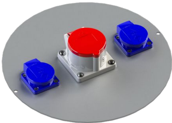
Standard center plate