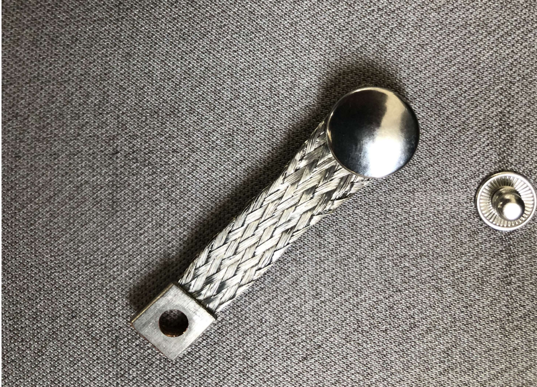
Picture 3: using textile rivets to establish electrical contact to the ground plane

The photo below shows an example, using rivets from a low cost textile riveting set along with a woven ground strap. The ground strap is clamped in between the two halves of the female rivet.