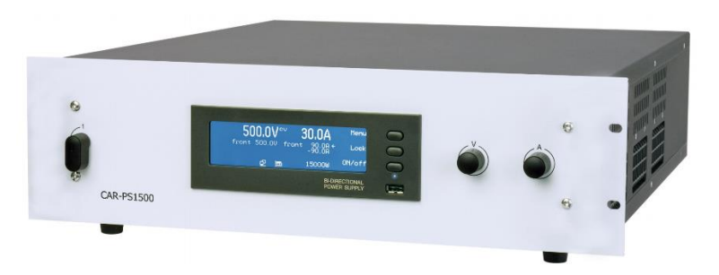
CAR-PS 1500 (standalone)