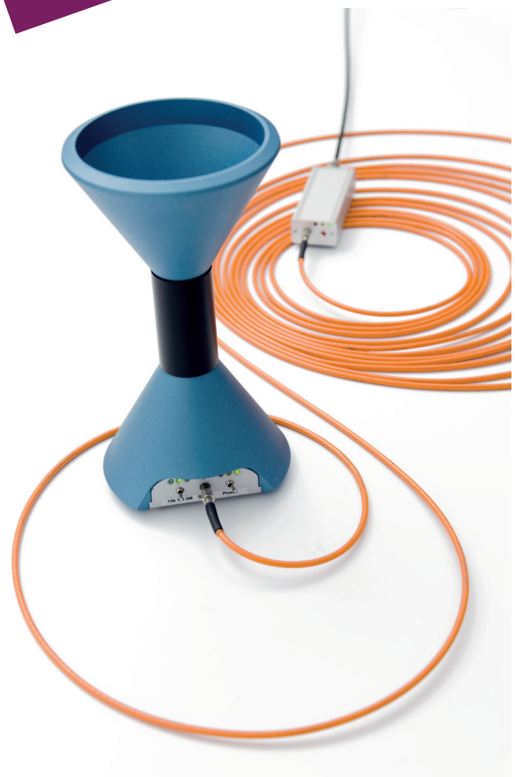
RefRad X Field Source with FibreLink X for frequency synchronization to increase the dynamic range by up to 30 dB (patent pending)