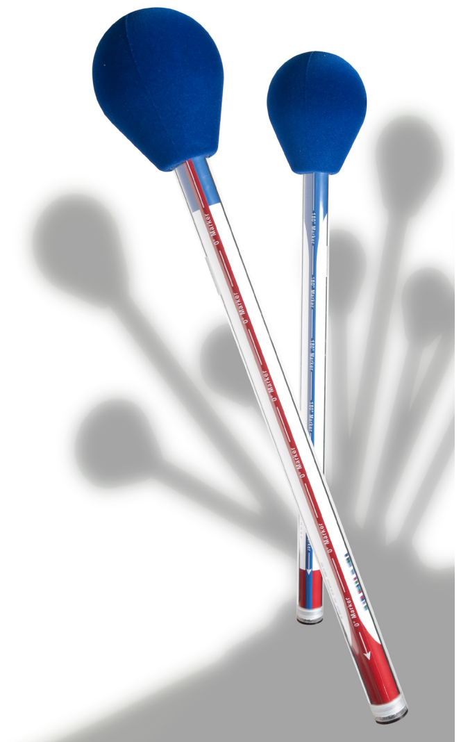
POD antennas for the frequency range 1-18 GHz